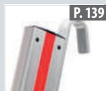
Support board set