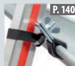
P. 140 Ladder holder set for gutters