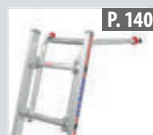
P. 140 Telescopic wall spacer for rung ladders