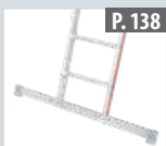
P. 138 Cross-beam for ladder section for retrofitting