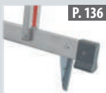
P. 136 Set of foot pikes for stiles